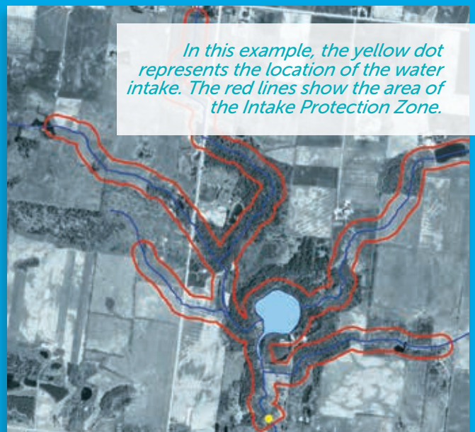
In this example, the yellow dot represents the location of the water intake. The red lines show the area of the Intake Protection Zone.

a larger part of the watershed. For the purposes of establishing the second intake protection zone, technical staff examine a minimum time of travel of two hours, although it could be longer if the water treatment plant operator response time is longer. River flows, streams feeding into the river or lake, and the location of municipal storm sewers or rural drains are all considered when determining an intake protection zone since they all affect time of travel. The third intake protection zone (not shown) covers a part of the watershed that may be impacted by an extreme event such as a storm, strong winds or high waves.