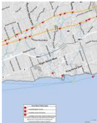
Figure 4.1: Sample policy header and sample applicability maps for wellhead protection area (left) and intake protection zone (right).