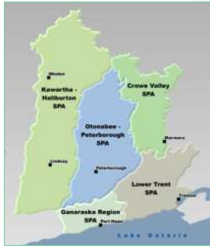
The five source protection areas that make up the Trent Conservation Coalition Source Protection Region

Drinking water systems in the Ganaraska Region Source Protection Area include municipal systems of various sizes that draw raw water from both groundwater and surface water sources. Municipal residential drinking water systems serve major residential developments. Small municipal residential systems serve fewer than 101 private residences, and large municipal residential systems serve more than 100 private residences.